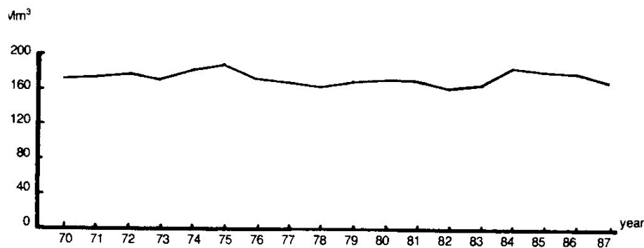
FIGURE 2 – The volume of wood consumed for energy in Brazil in millions of cubic meters. (BRASIL. MINISTÉRIO DA AGRICULTURA, 1984).